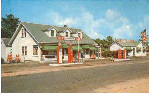
So. Wellfleet General Store, c.1950s