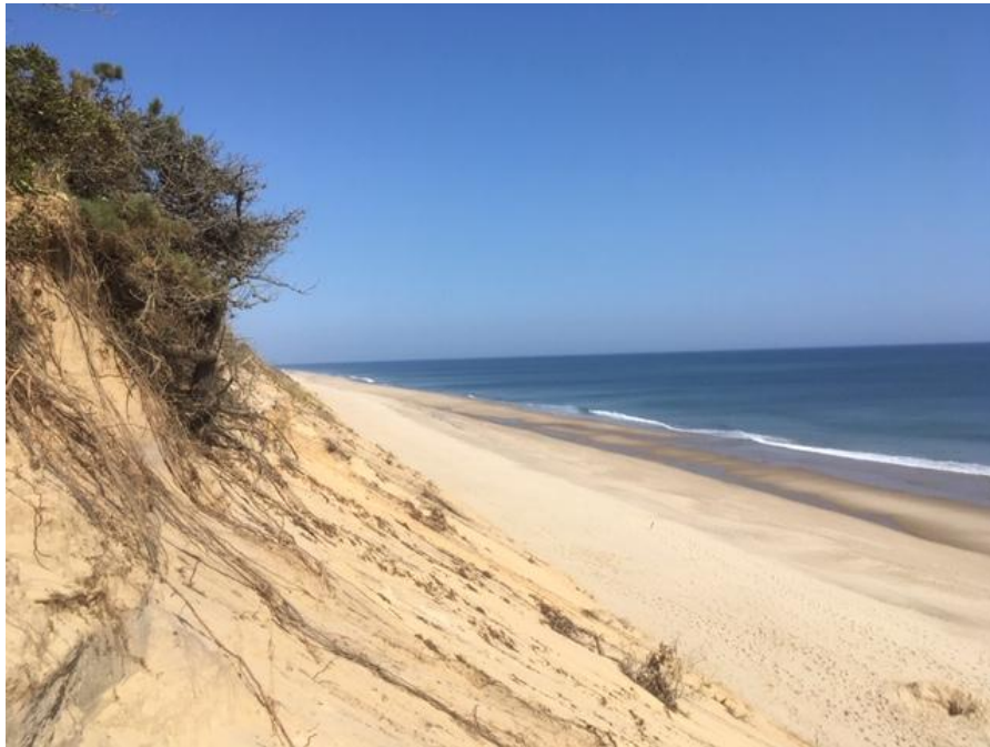
September beach day, LeCount Hollow

As you know if you read the regular updates from WSRA this spring, Wellfleet did not escape the scourge of Covid-19, no matter how far away it sometimes seems from “the real world.” In the early months, the pandemic closed Town Hall, the library, theaters, churches, stores, motels, and restaurants—not to mention the swap shop--and threatened to devastate the 2020 tourist season. In May and June, many renters cancelled and others hesitated to book. Some seasonal residents joined the “covid refugees” leaving New York, Boston and other cities where the virus was surging and opened their Wellfleet houses months earlier than usual. Both year-rounders and seasonal residents pitched in to help feed hungry families. As it turned out, visitors did come, perhaps because the Cape is accessible by car to millions of people. From the middle of June to the middle of September, while a drought produced perfect vacation weather, the beaches were full of socially distanced groups using reconfigured parking lots.